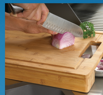
70012 – Professional Cutting Board