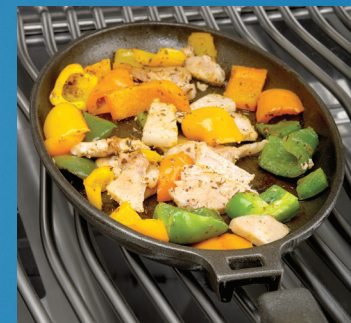
56003 – Cast Iron Skillet