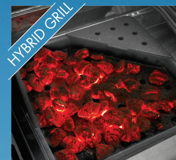
67731 – Charcoal Smoker Tray