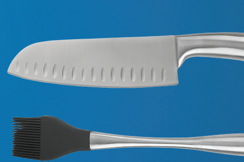
70012 – Professional 5 pce Tool Set