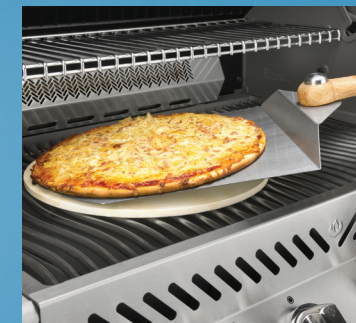
70003 – Pizza Spatula