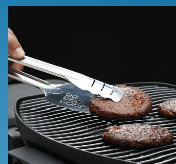
55019 – Stainless Steel Spatutong