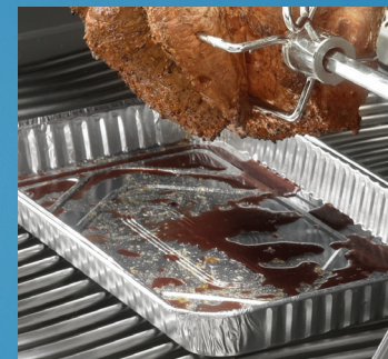
62008 – Large Drip Pans