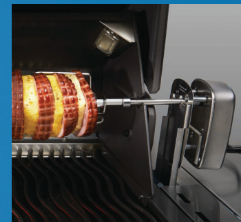
69334 – Professional Rotisserie Kit