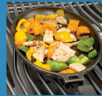
56003 – Cast Iron Skillet