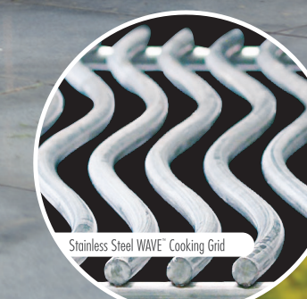
Stainless Steel WAVE™ Cooking Grid