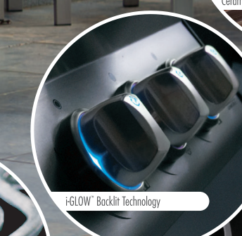
i-GLOW™ Backlit Technology