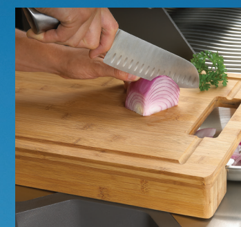
70012 – Professional Cutting Board