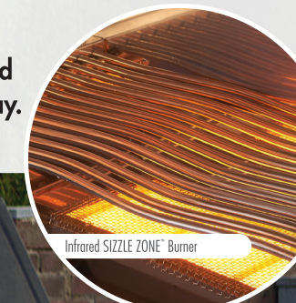
Infrared SIZZLE ZONE™ Burner

Want that smoky goodness? Add wood directly on the preheated coals or place them in the wood chip chamber in the charcoal tray.