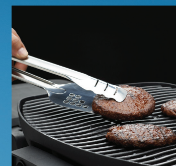
55019 – Stainless Steel Spatutong