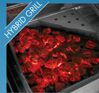
67731 – Charcoal Smoker Tray