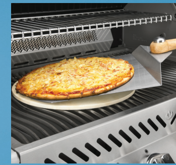
70003 – Pizza Spatula