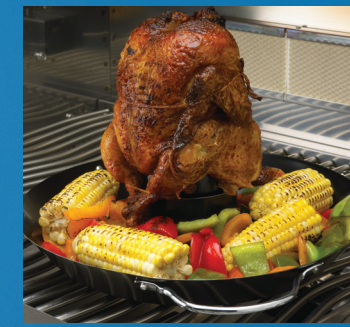
69334 – Professional Rotisserie Kit