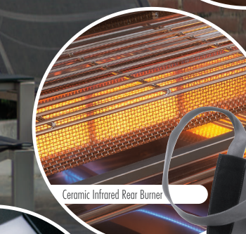
Ceramic Infrared Rear Burner