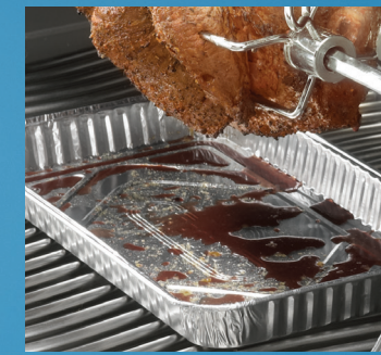
62008 – Large Drip Pans